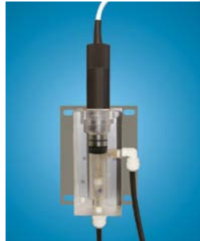
Sealed Acrylic Flowcell