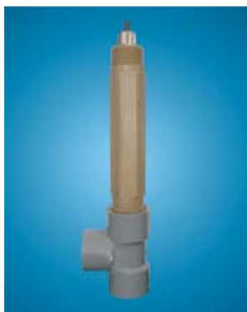
1" Flow Tee

The 1-1/2" or 2" union mount systems can be used with pipe sizes up to 2 inches. The union mount hardware allows for easy removal of the sensor from the hardware without twisting the sensor cable.