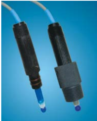
Twist-Lock Sensor (with or without pipe adapter)