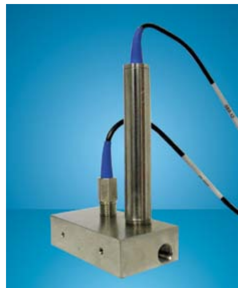
High Purity Water Sensor & Flowcell

Superior Sensor Technology for Advanced Process Measurement.