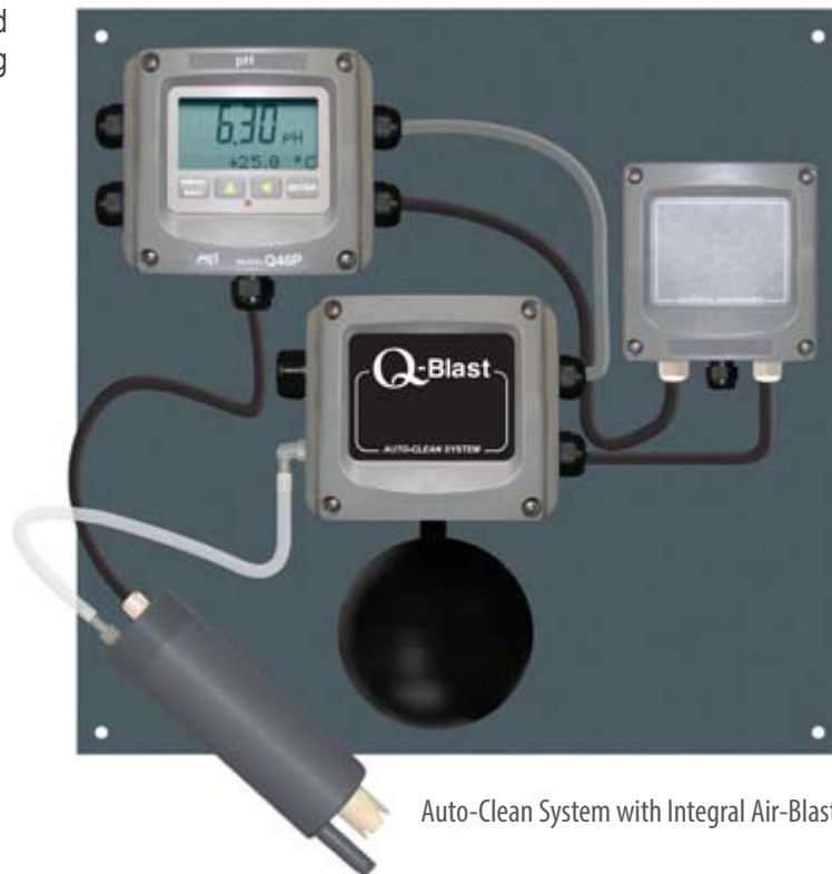
Auto-Clean System with Integral Air-Blast

A Blast of Air keeps the Auto-Clean Sensor Clean!